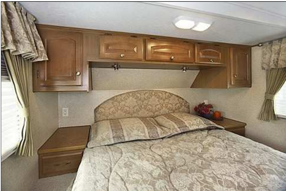
"Bedroom & Bath Area"