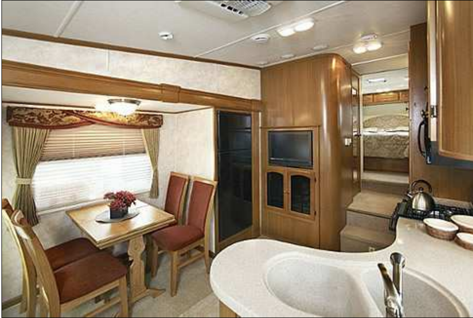
"Optional 26" HD LCD TV available with the 25E30.